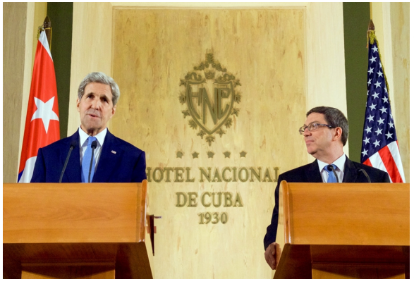
Secretary of State John Kerry and Cuban Foreign Minister Bruno Rodríguez address reporters during a joint news conference at the Hotel Nacional in Havana, Cuba, on August 14, 2015.

This PDAA luncheon program will be held from 12 noon to 2 p.m. on Monday, November 16 at DACOR-Bacon House, 1801 F Street NW, in Washington, D.C. Reservations are $35 for members and $42 for nonmembers. The deadline for reservations is Tuesday, November 10. You can reserve with a credit card at www.publicdiplomacy.org or complete and mail the form on page 7 with your check.