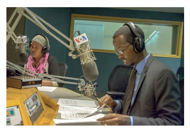
VOA Somali broadcast, December 2015, (photo, BBG.gov)

February 1, 2017. Reprinted with permission, BBG.gov.