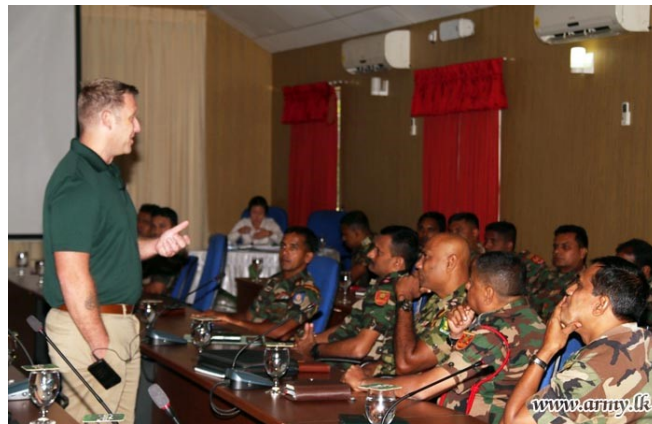
The US Embassy in Colombo sponsored a workshop for the Sri Lankan military in September 2017. It focused on "structure and purposes of psychological operations, information management, process of psychological operations, target audience analysis, recognition of propaganda and review," according to a Sri Lankan military website. It was presented by USPACOM.