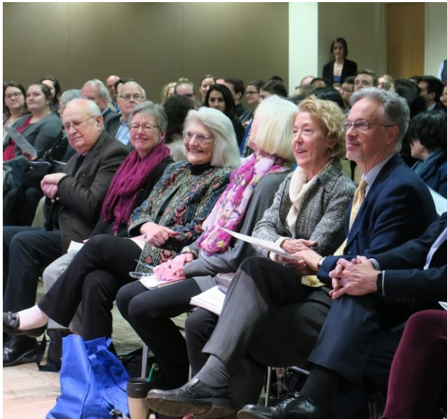
Making the Hard Case for Soft Power at American University February 25, 2019.