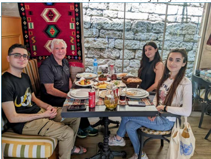
The author at a luncheon in Baku, Azerbaijan, with three alumni of the FLEX program who are now university students.